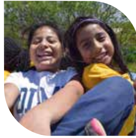
Left: Increasing enrollment of Newark youth in i2 Camp to deepen their interest in Science, Technology, Engineering, and Math